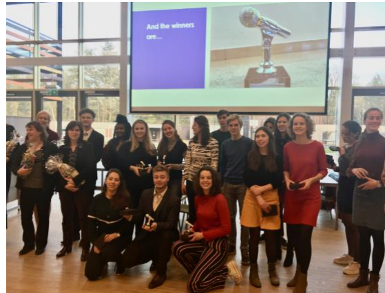
BBC Essay Writing and Speaking Contest

Ability to meet deadlines is an important characteristic of a successful IB student.