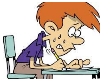
Cambridge and IB exams

At the end of the two-year programme, students are assessed both internally and externally in ways that measure individual performance against stated objectives for each.